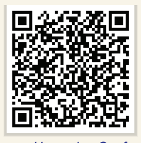
chart.org > Upcoming Conferences

If you have 5 or more trainers on your team, consider a corporate membership! More information at chart.org > Membership & Community > Corporate Membership Packages