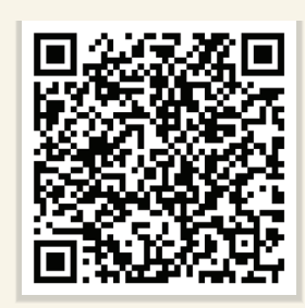
chart.org > Upcoming Conferences

If you have 5 or more trainers on your team, consider a corporate membership! More information at chart.org > Membership & Community > Corporate Membership Packages